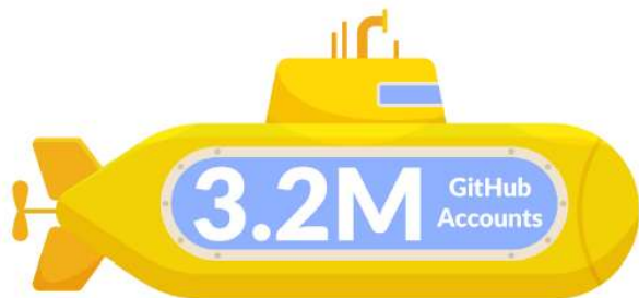
Figure 1. UK GitHub Accounts 2023